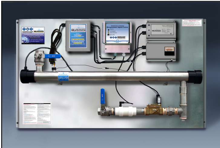
TWT-DP-06 (30 GPM)

Test proves Triangularwave Technologies (TWT®) Deposit Control System reduces the fouling effects caused by "hard water" on the quartz sleeve and UV lamp inside the disinfection/purification unit while maintaining the residual effects downstream chemically free.